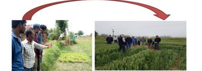
Farmer A of Tyllilang Farmer B of Tyllilang