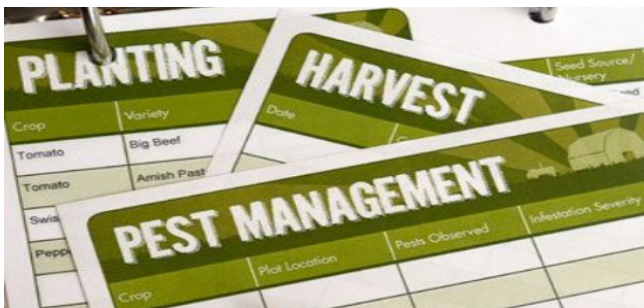
Game cha-gipani rakkiani kitap- Name tale see donani aro ki-tap rakkianiko dakna nanga