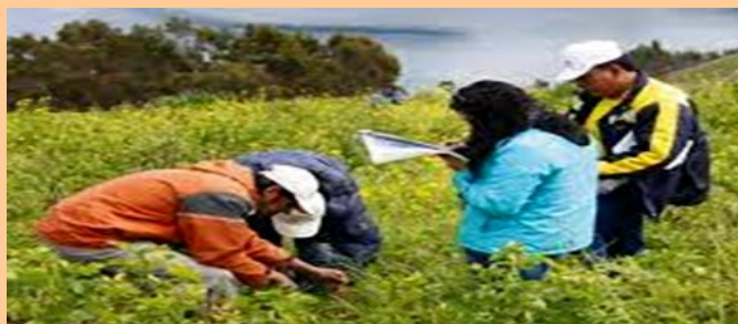
Somoi gita kam ka-chakgipa biaprangko nirokani