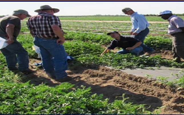
Groupni tom-ani- • Kariprakni ge-anirangna komibeoba changsa tom-ani. • Bilsiprako ge-giparangna bilsio changbri tom-ani • Tangkamgipa bolrangna komibeoba changgni tom-ani